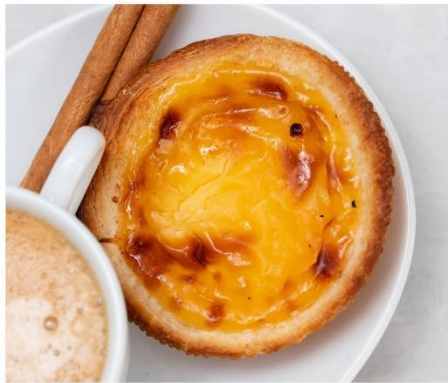
Pastel de Nata Portugal