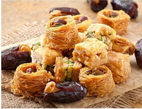
Baklava Greece and Turkey